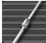
DO-204AL (DO-41 Glass)