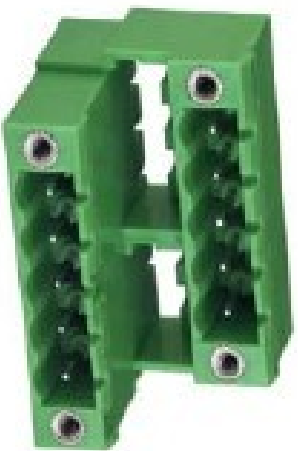
YE160-500 / YE160-508