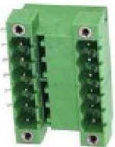
YE250-500 / YE250-508