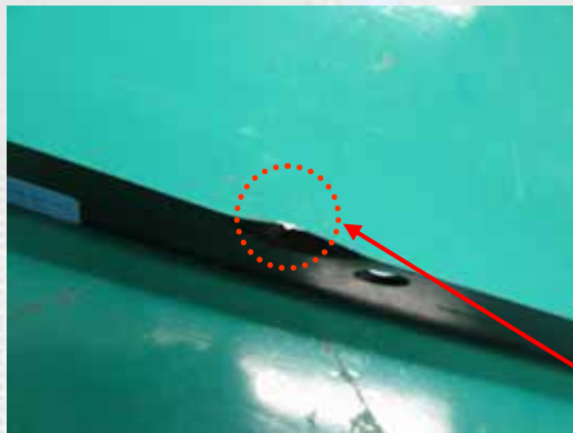
Damaged Top Chassis