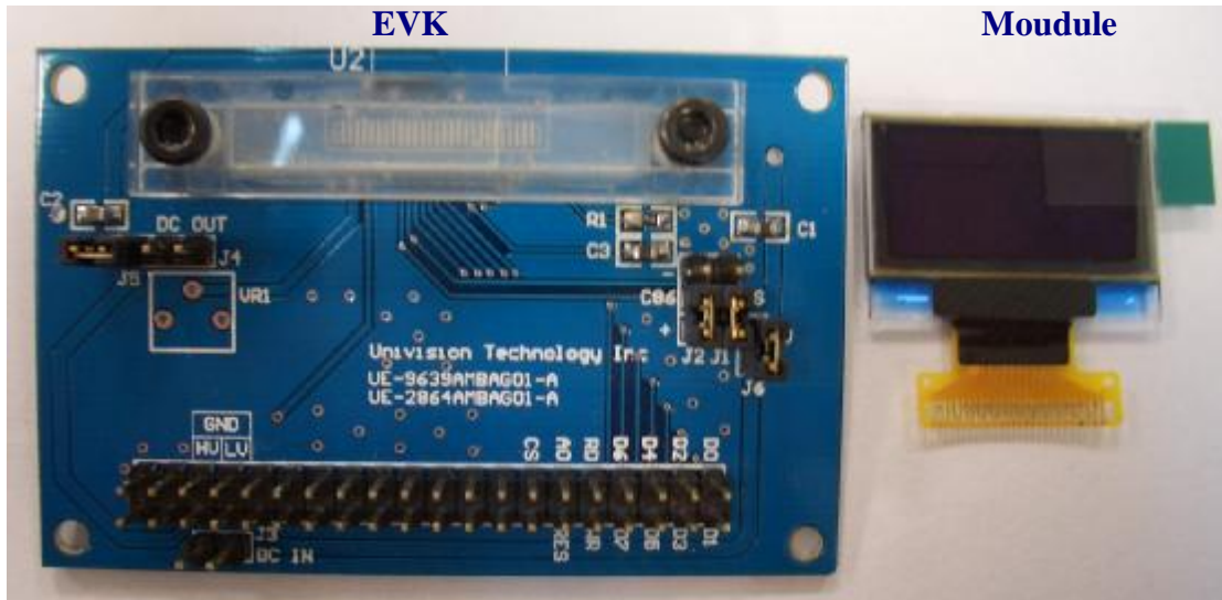
Figure 2 EVK PCB and OLED Module(Top View)