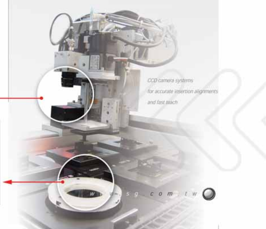
CCD camera systems for accurate insertion alignments and fast teach