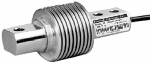
DIMENSIONS / 外形尺寸