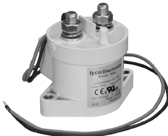
EV200 Series Contactor (CZONKA® Relay, Type III)

Typical EV200 applications include battery switching and back-up, DC voltage power control, circuit protection and safety.