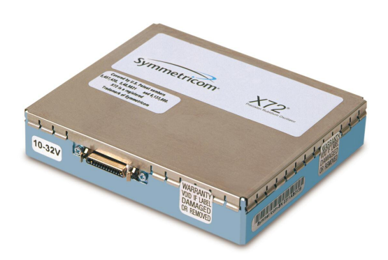
The X72 rubidium atomic oscillator

The X72 provides highly precise outputs using the inherent stability of the rubidium atom, in a compact form factor. This delivers an excellent value to the market for a wide range of applications.