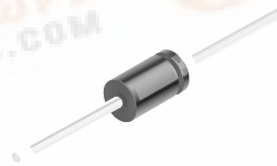
DO-41 Glass case COLOR BAND DENOTES CATHODE